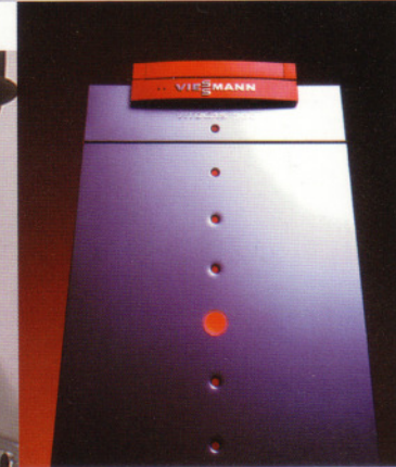
Vitogas, Viessmann Phoenix Produkt Design