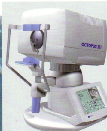
Perimeter, Octopus 301 Meyer - Hayoz Design Engineering AG