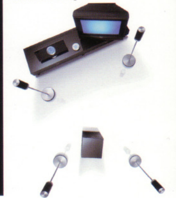
Loewe Systems Phoenix Produkt Design