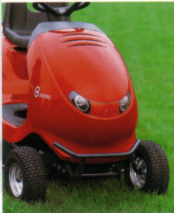
Traktormäher, tractor mower, Concord Weinberg + Ruff Produktgestaltung