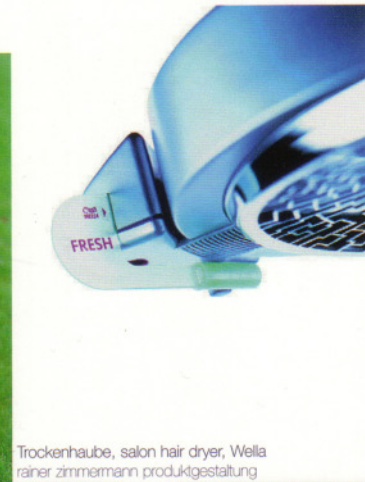
Trockenhaube, salon hair dryer, Wella rainer zimmermann produktgestaltung