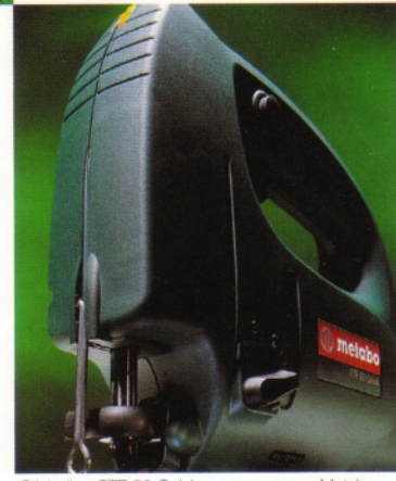
Stichsäge STE 80 Quick, compass saw, Metabo Weinberg + Ruff Produktgestaltung